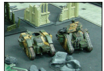
Abandoned wreckage of Cadian tanks lie in the outskirts of Hubris

“Port Hubris will be retaken”, Major Shiraz recently told reporters at a news conference. “The tactical withdrawal from Port Hubris is only temporary, and was done with the long term in-